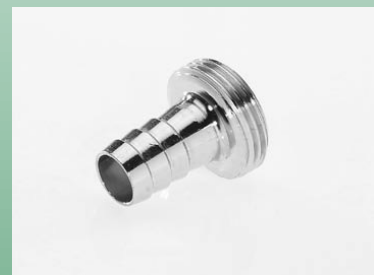
3/4 bsp x h'tail (3/8 1/2 3/4)