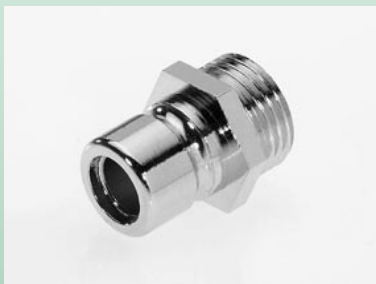
Larger size mould plug

Aztech Components focus on the supply of specialist fittings for manufacturing industry. We supply the complete range of mould couplings for cooling systems in the extrusion industry. Materials include plain brass, plated brass & stainless steel.